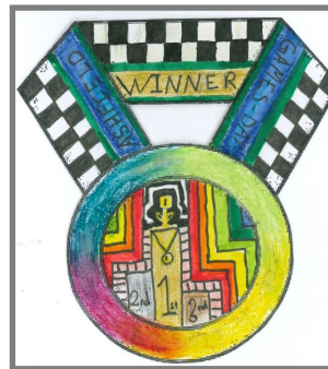
Alice - 6H