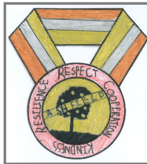
Haruto - 5D