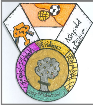
Sienna - 3AC

Congratulations to the following children who designed a medal for Games Day. Well done!