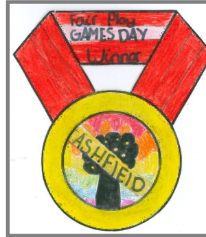
Liya - 4V