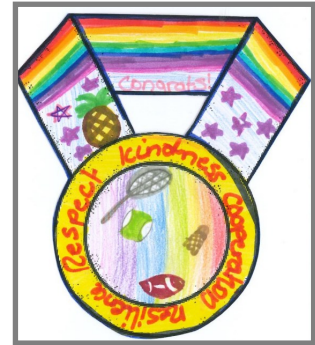
Ruby - 4C