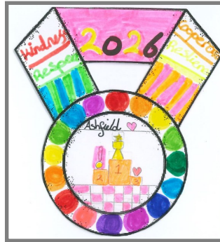
Armina - 3M